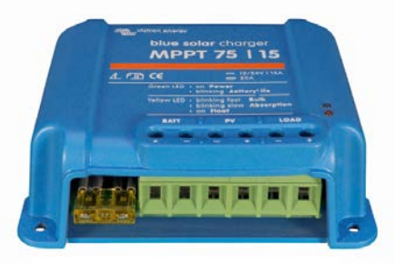
Solar charge controller MPPT 75/15