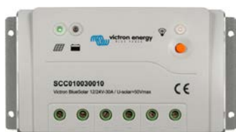
BlueSolar PWM-Pro 10 A