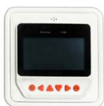
BlueSolar Pro Remote Panel