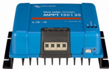
Solar charge controller MPPT 150/35